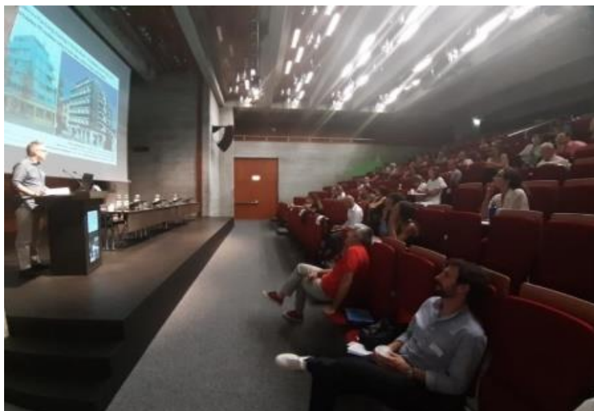
Figure 3. Image of the ‘Solar architecture: energy in Dialogue’ event in Canobbio, organised by SUPSI.

and plan, with related organisations such as the Energy Savings Trust speaking on how it would be implemented. The second day was focused on technical level matters. Table 2 shows the list of these events.