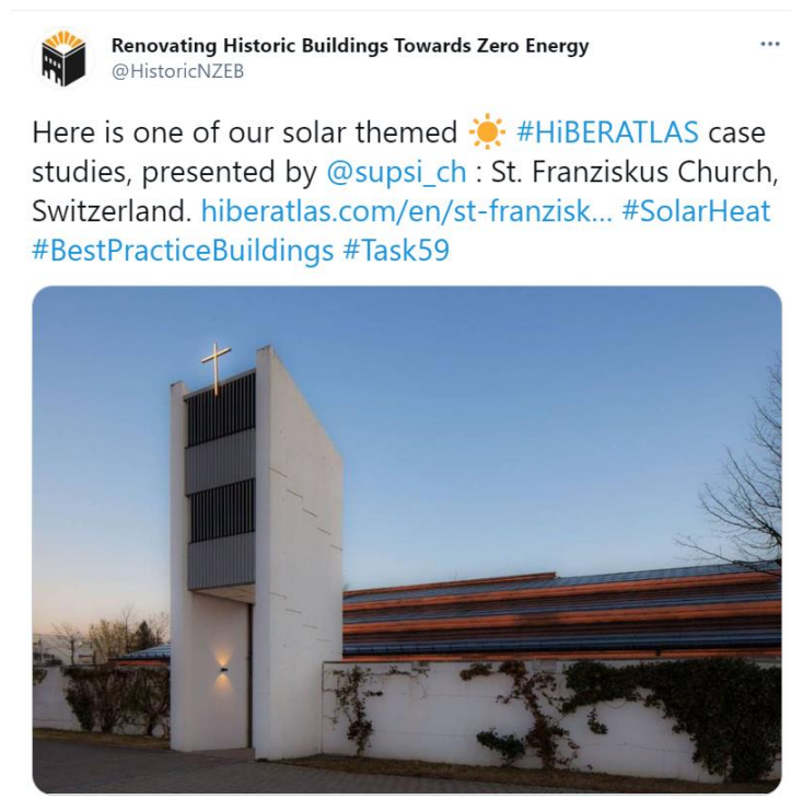
Figure 12. A social media post highlighting one of the HiBERAtlas case studies, linking to the partners responsible as well as the #SolarHeat hashtag.

Another important part for the dissemination was the social media posts, an example of which is shown in Figure 12. Many of the posts in 2020 linked back to the case studies. As the case studies were finalised and available online, they were publicised via a social media post. Features, such as the geographic search, were also mentioned via social media, to show the full range of functionality of the database. The posts served as a hook to invite followers to find out more about the case studies as well as the database as a whole.