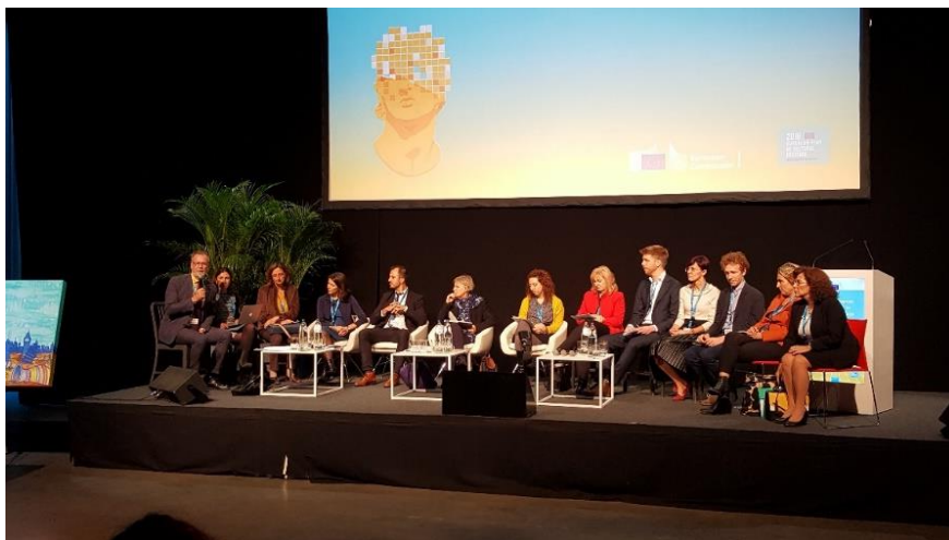
Figure 6. Fair of Cultural Heritage discussion panel.

Some events favoured a speakers' panel at the end of each session, where there could be a discussion of specific points, as at Figure 6. A list of these events is presented in Table 3.