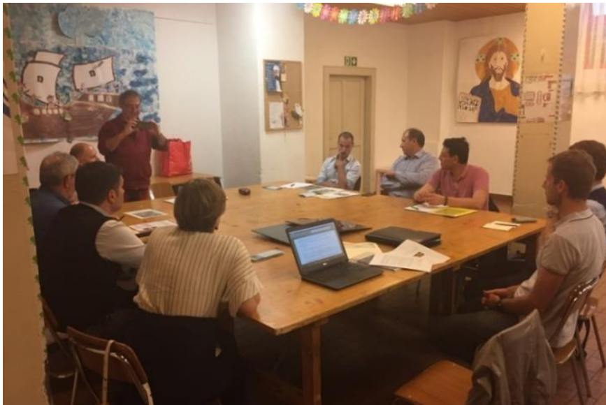
Figure 5. Image from the meeting and worktable for construction of a solar plant in a historic church in Lugano, organised by SUPSI.

Some events favoured a speakers' panel at the end of each session, where there could be a discussion of specific points, as at Figure 6. A list of these events is presented in Table 3.