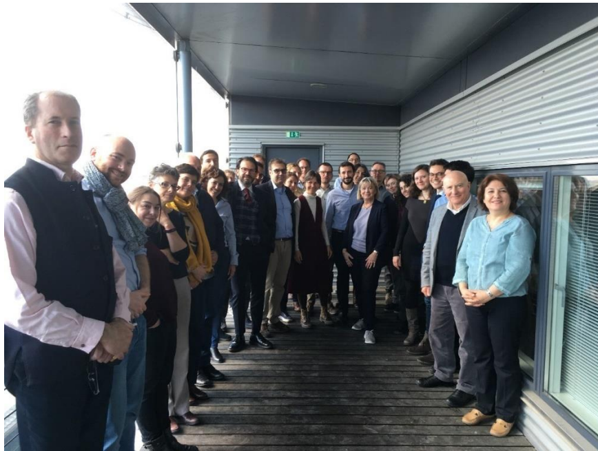
Figure 1. Meeting and networking in Copenhagen.