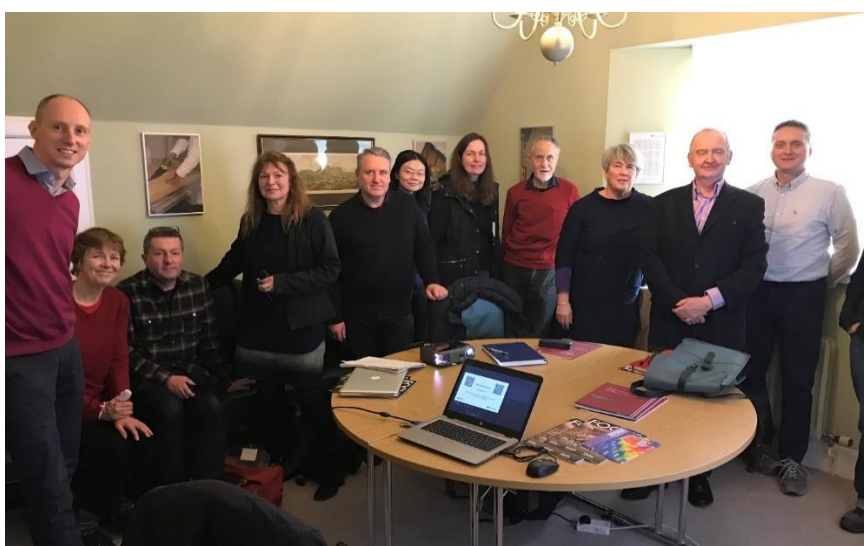
Figure 4. Architects CPD event at Holyrood Park Lodge, Edinburgh.

This level of engagement sought interaction with designers and specifiers of energy improvements. This might include architects, surveyors and municipal design and planning officers. This was often achieved by partners putting on, or contributing to, national level professional associations’ CPD programmes. For example, HES worked with the Royal Incorporation of Architects in Scotland (RIAS) on a CPD for local chapters in Aberdeen and Glasgow in 2020 and 2021. There was similar activity with the Royal Institute of Chartered Surveyors (RICS) in Scotland. This type of interaction was concerned mainly with technical and design details, compliance with national and European standards and publicising the newsletter and the best practice database. Sometimes the activity was concerned with dialogues and options on a specific project or technology in a building. For example, HES showed the retrofit measures of their case study building Holyrood Park Lodge to architects (Figure 4). Figure 5 shows a discussion organised by SUPSI concerning a solar array on a church in Lugano.