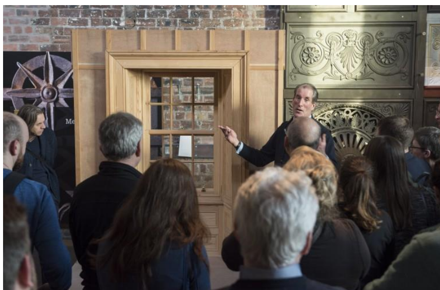
Figure 8. A model of a historic timber window made by HES at the Engine Shed being used in trade outreach © HES.