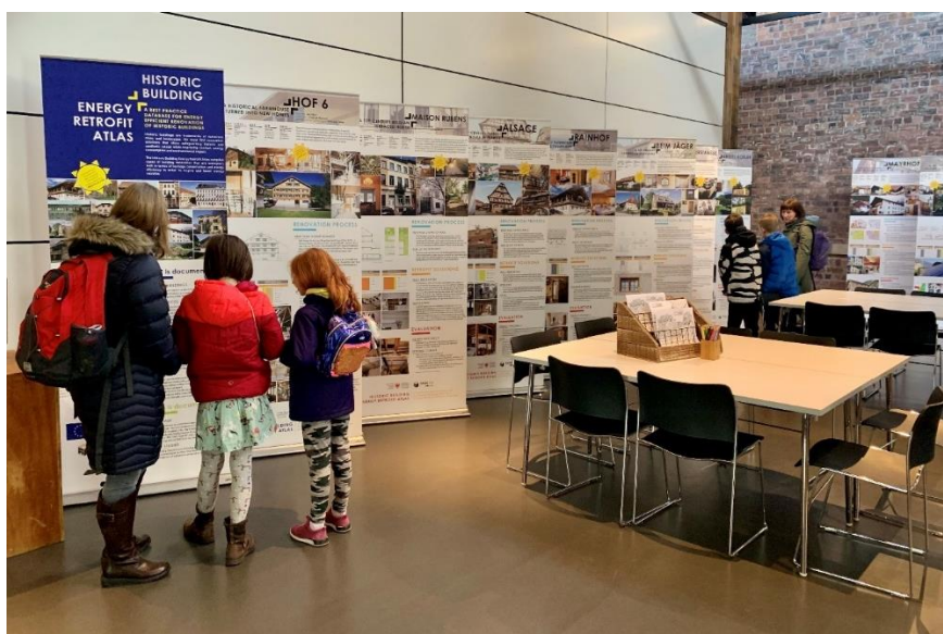
Figure 9. The pull up banners at the Engine Shed in Stirling, Scotland during an outreach event.

A touring exhibition was one of the Subtask D deliverables. One of the project partners, EURAC, led on the design and print of 12 pull up banners to showcase the work of partners across the project area. This was completed in Year 2 of the project, and a schedule of locations was agreed with EURAC and partners at the expert meeting in Munich. They were used to support other outreach activity organised by partners and associated organisations. Their positioning was generally in the hall or foyer space of a venue, where attendees could circulate among the banners; an example of such a placing is at Figure 9, where the banners were used to support the HES event at the Engine Shed in Stirling, Scotland. By late 2019 the exhibition had been moved to five locations (see table 6 for the schedule) but the onset of restrictions in Spring 2020 obliged it to be returned to EURAC. In addition to the events where the banners were used, the list below shows the potential events where banners were planned to be present, which had to either be cancelled or held online due to the restrictions.